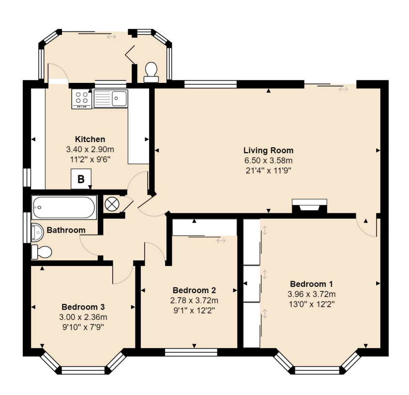
\label{eq:total_section} Total\ Area:\ 82.2\ m^2\ ...\ 884\ ft^2 All measurements are approximate and for display purposes only

Cheddar, Emmets Nest, Binfield, Bracknell, RG42 4HH