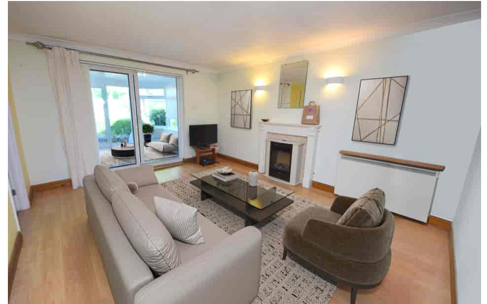
44 Whitton Close, Greatworth, Banbury, Northamptonshire. OX17 2EH Guide Price £269,000 - Freehold