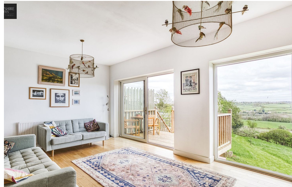
Town Street, Holbrook, Belper, Derbyshire DE56 0TA £500,000 -