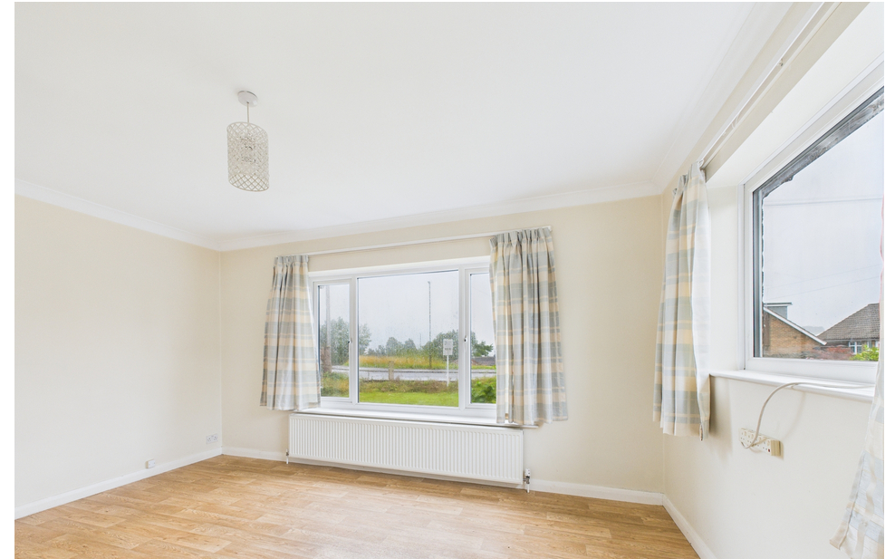
Over Lane, Belper, Derbyshire DE56 0HJ £325,000 - Freehold