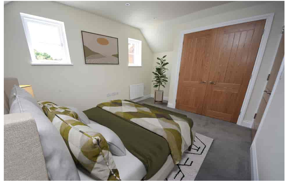
3 The Old Elephant & Castle, Causeway, Banbury, Oxfordshire. OX16 4SN Guide Price £250,000 - Freehold