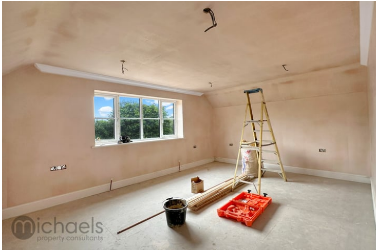
18' 0" x 12' 9" (5.49m x 3.89m) UPVC window to front.