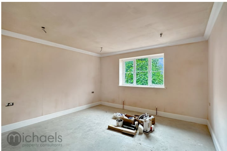
14' 3" x 11' 9" (4.34m x 3.58m) UPVC window to rear.