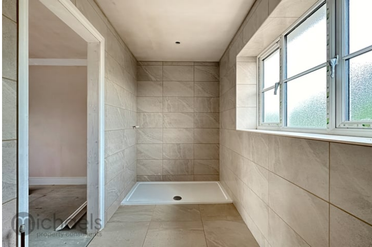
12' 6" x 5' 2" (3.81m x 1.57m)