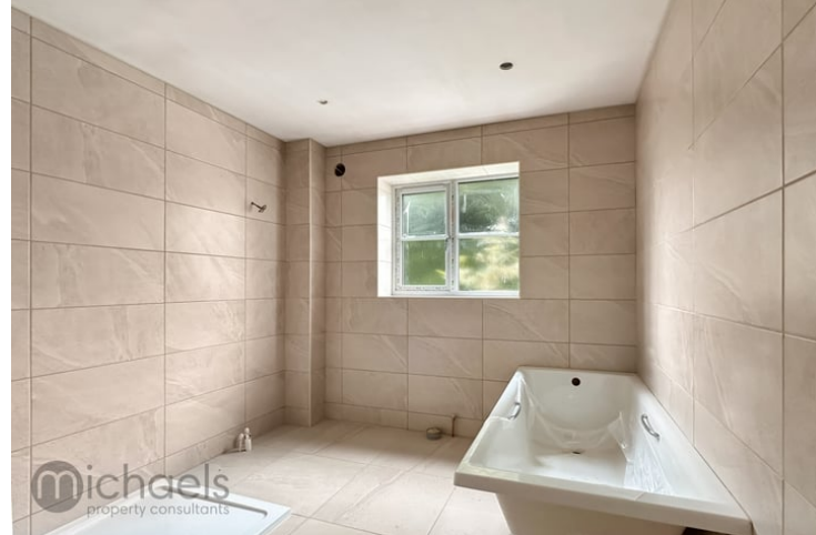
8' 6" x 8' 6" (2.59m x 2.59m) Three piece suite.