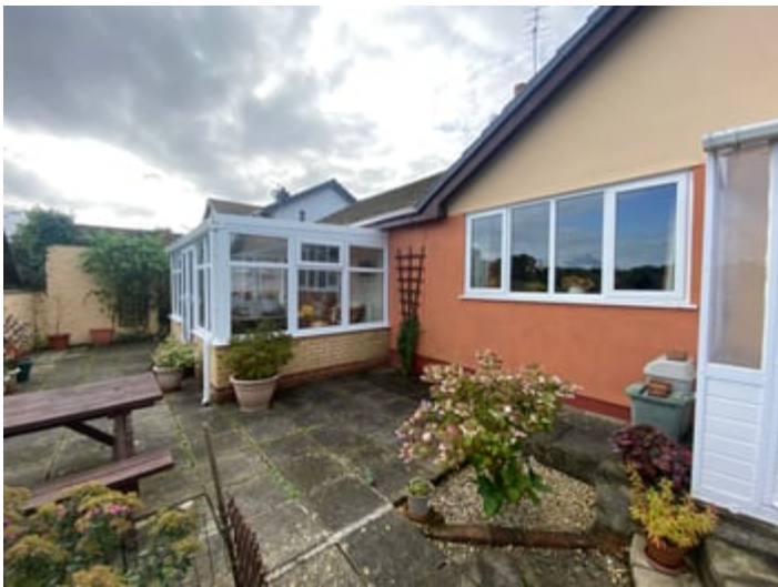
PATIO AREA (THIRD IMAGE)