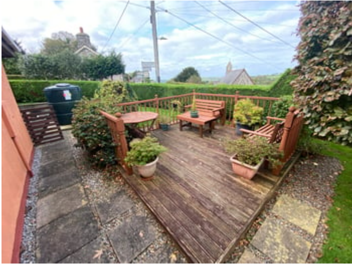
PATIO AREA (SECOND IMAGE)