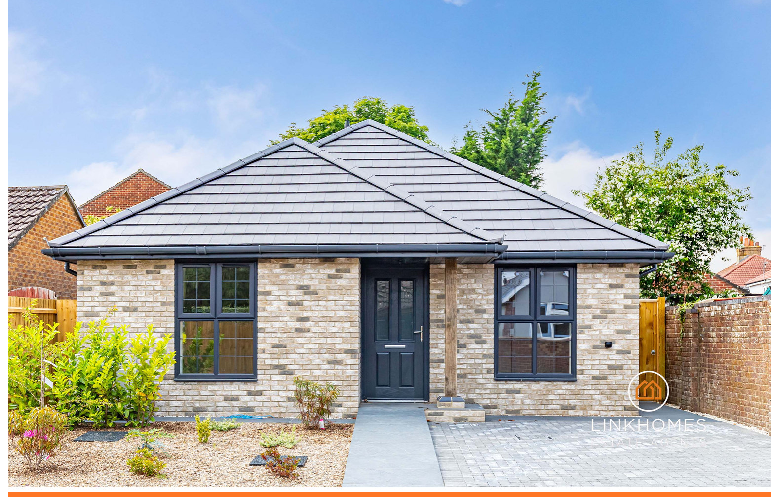
2 Charles Gardens, Bournemouth, Dorset, BH10 5EH Offers Over £325,000

** BRAND NEW TWO BEDROOM DETACHED BUNGALOW ** 10 YEAR WARRANTY ** Link Homes Estate Agents are delighted to present for sale this immaculate two bedroom detached new build bungalow situated in the BH10 postcode. Benefitting from an array of standout features including two double bedrooms with one offering built-in wardrobes, an open-plan kitchen/living room with integrated appliances and French doors leading onto the low maintenance fully landscaped private rear garden, a stylish four-piece bathroom suite, underfloor heating throughout and a block-paved driveway with parking for one vehicle. This property is a must view to avoid disappointment!