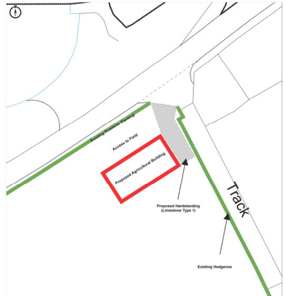
Land off Coach Road - Proposed Agricultural Building - Block Plan