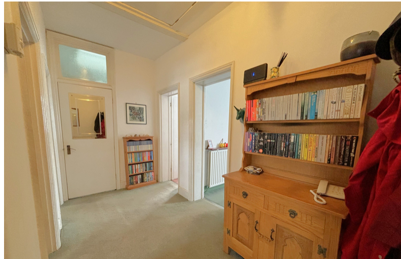
TOP FLOOR FLAT 729 sq.ft. (67.7 sq.m.) approx.