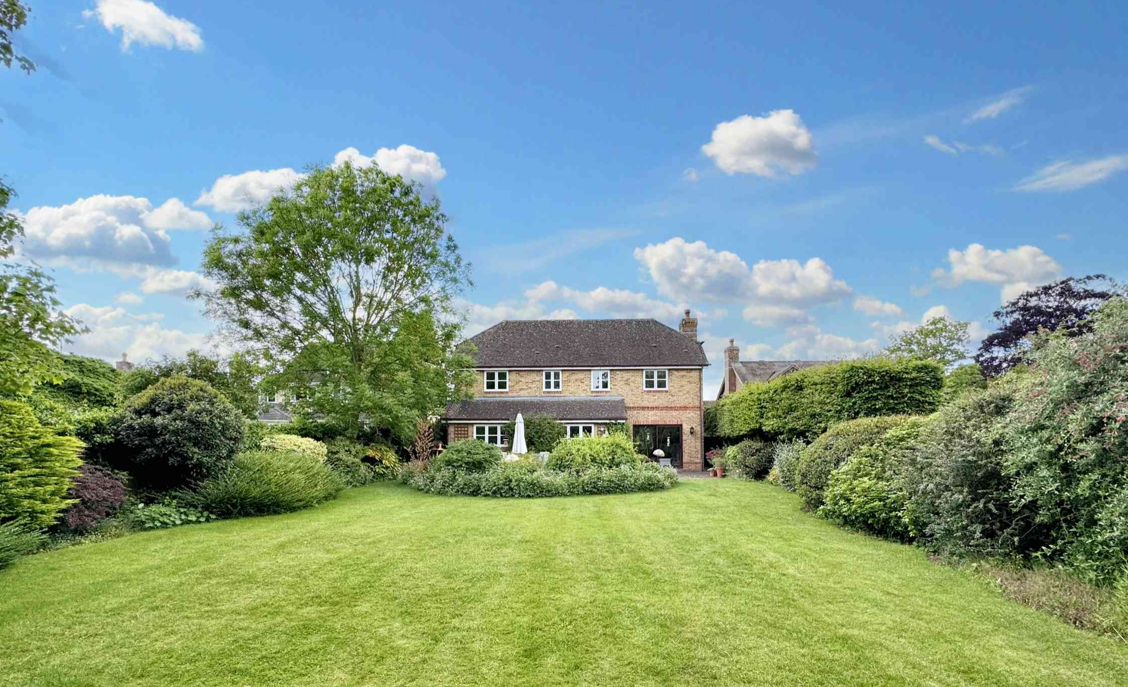
Mulberry House, Coxwell Road, Faringdon Oxfordshire, Offers in Region of £825,000