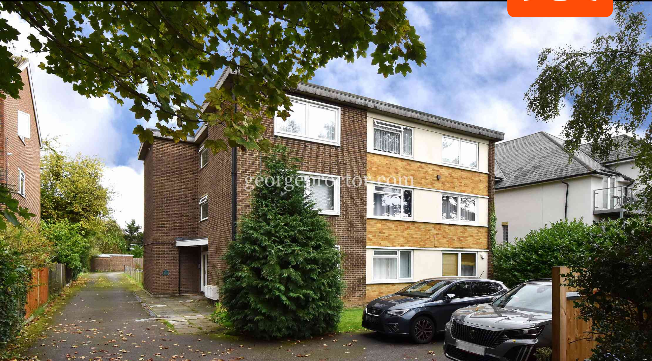
Beckenham Grove, Bromley, Kent. BR2 0XB