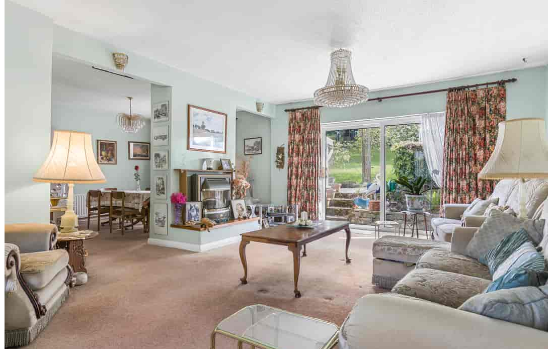
81 Marlow Bottom, Marlow, Buckinghamshire SL7 3NA Offers in Region of £675,000 - Freehold