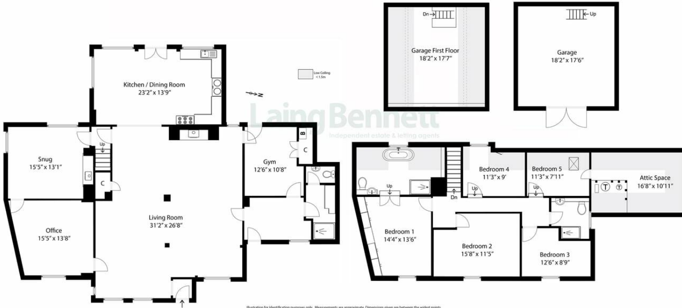
Illustration for identification purposes only. Measurements are approximate. Dimensions given are between the widest points. Not to scale. Outbuildings are not shown in actual location.

Approximate Gross Internal Area (Including Low Ceiling) Excluding Roof = 338 sq m / 3633 sq ft Garage = 59 sq m / 636 sq ft