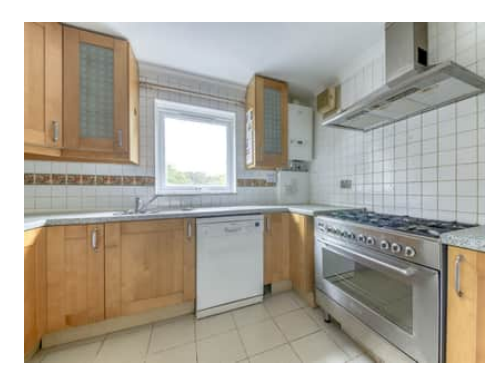
Flat 4, 31 Woodville Court, Sylvan Road, London, SE19 2SG £330,000 Leasehold