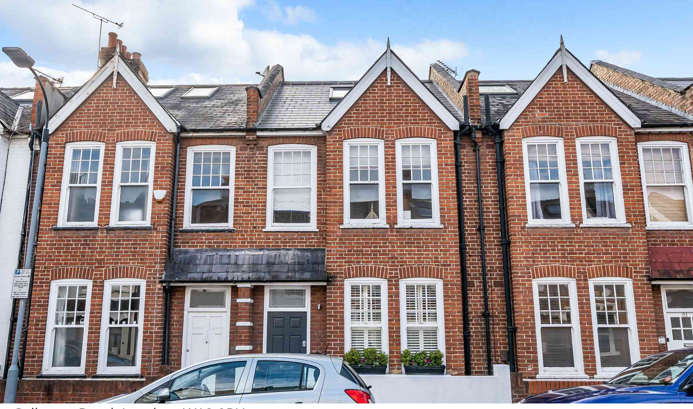
Galloway Road, London, W12 0PH