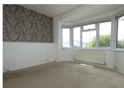
Flat 3 32 Brailswood Road, POOLE, Dorset BH15 2JW