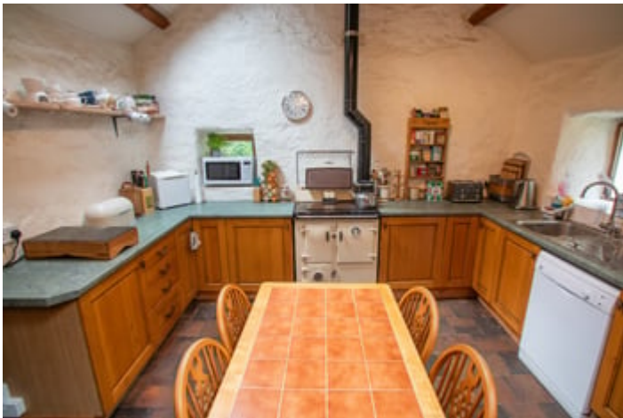
Kitchen (Fourth Image)