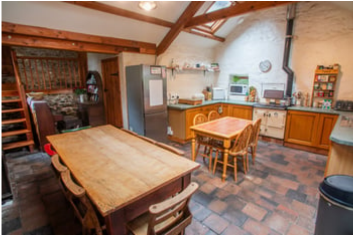
Kitchen (Third Image)