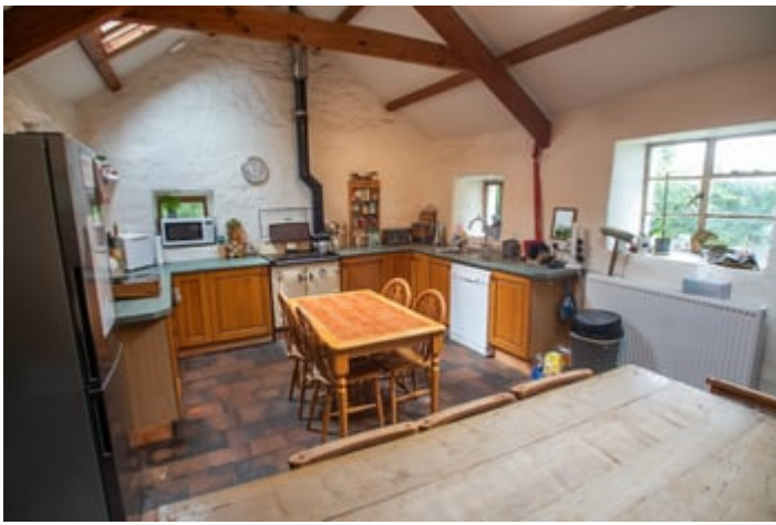
Kitchen (Second Image)