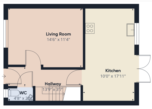
Floor O Building