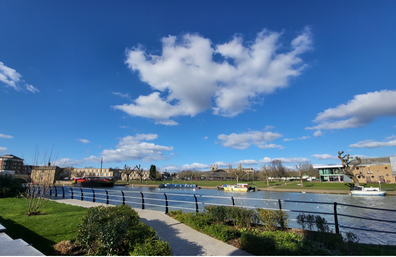
*** NO ONWARD CHAIN! *** "This 2 bedroom apartment in the popular development of Fletton Quays, is just a stones throw away from the city centre. Benefiting from a dedicated parking space behind gates, an entrance hall with cupboard, 2 bedrooms with fitted wardrobes in one, a bathroom with interactive features and the open plan kitchen/living space with balcony. EPC Energy Rating - B/ Council Tax Band - B".