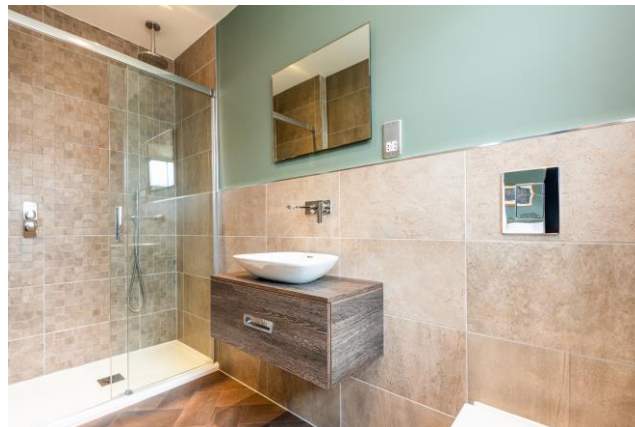
BEDROOM 2 EN-SUITE

FAMILY BATHROOM (10' x 7'3) Four piece suite comprising tiled shower cubicle with rainfall shower and shower attachment, panelled bath with handheld shower attachment, low level WC and vanity unit wash hand basin. Chrome towel rail radiator, fully tiled walls, tile effect flooring, ceiling spotlights and UPVC double glazed frosted window.