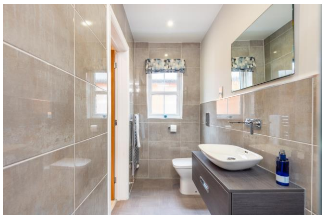
MASTER BEDROOM EN-SUITE

BEDROOM 2 (12' max x 11'4 max) UPVC double glazed window, radiator and door to en-suite shower room.