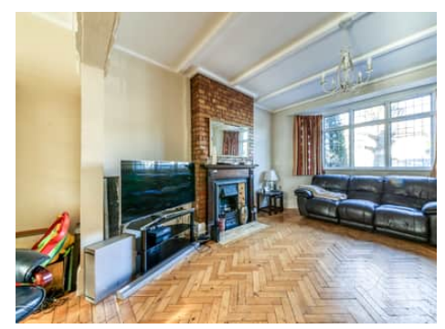
Mitcham Park, Mitcham, Surrey, CR4