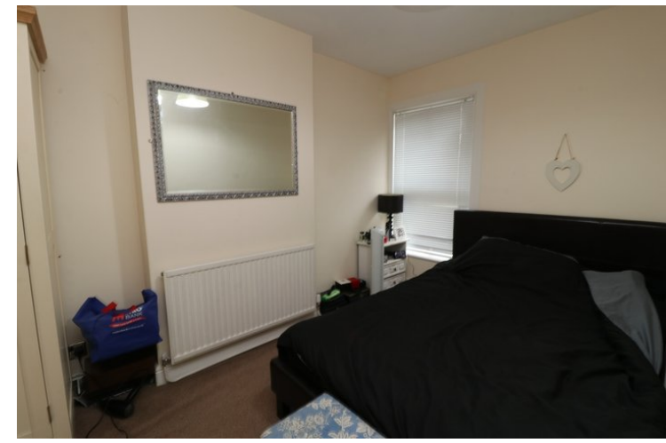
11' 1" x 10' 8" (3.38m x 3.25m) Double glazed window to front aspect, radiator.