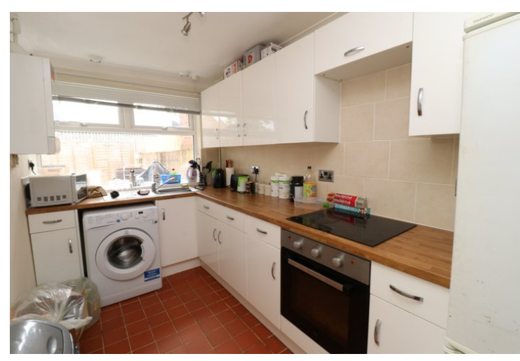
12' 5" x 6' 5" (3.78m x 1.96m) Double glazed window to rear aspect, a range of wall and base units over an area of roll edge work tops, inset sink and drainer unit, space for appliances and a free standing cooker, door leading to the rear garden.