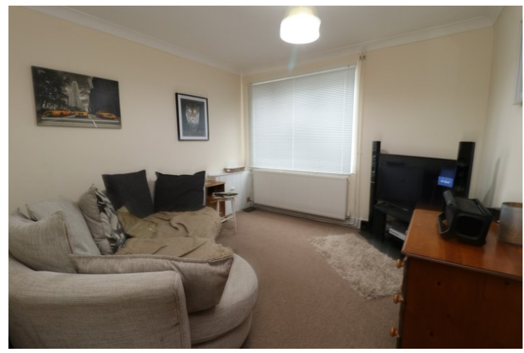
10' 8" x 10' 11" (3.25m x 3.33m) Double glazed window to front aspect, T.V and phone points, radiator.