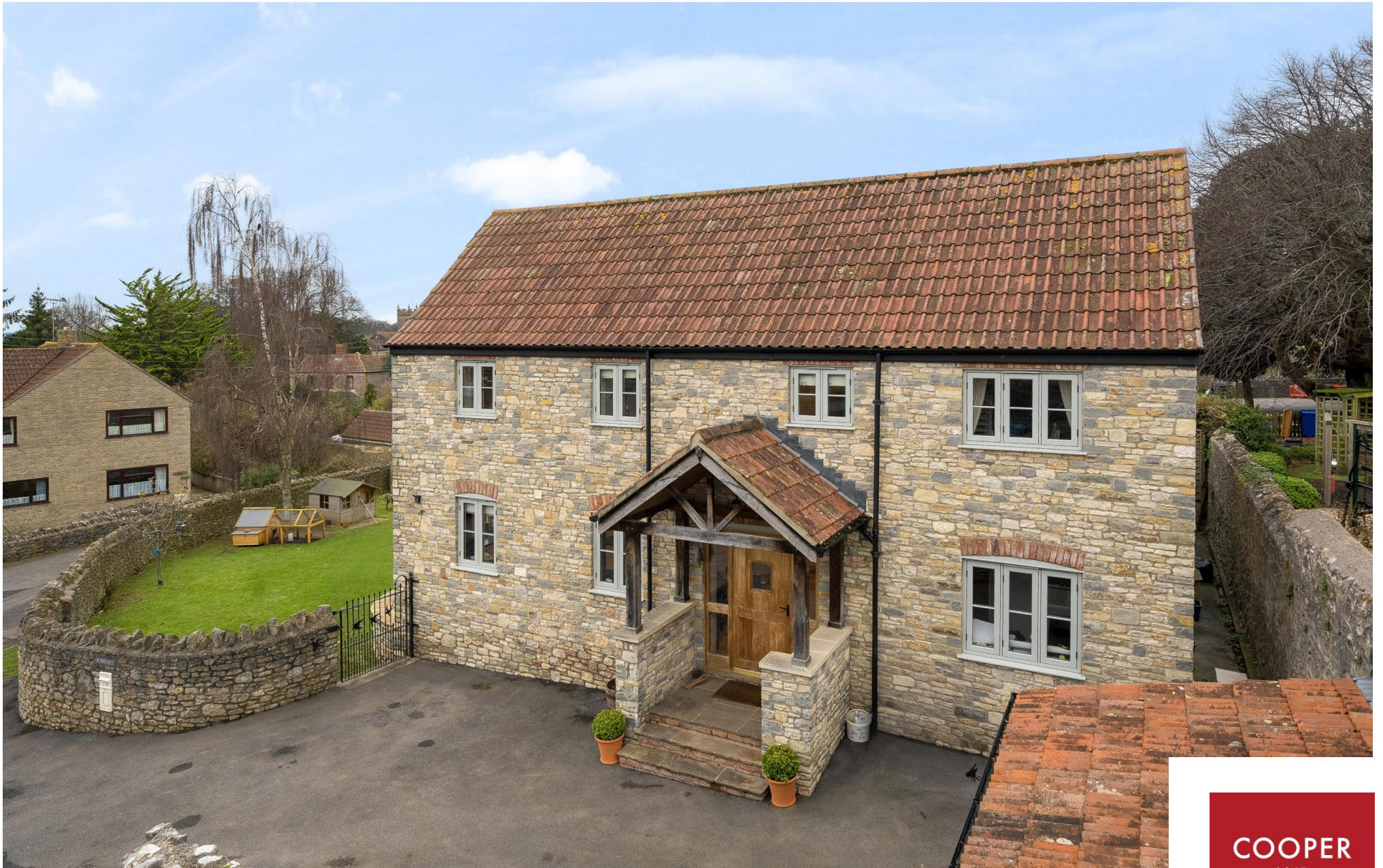
Sunnyside, Crow Lane, Westbury-Sub-Mendip, BA5 1HB