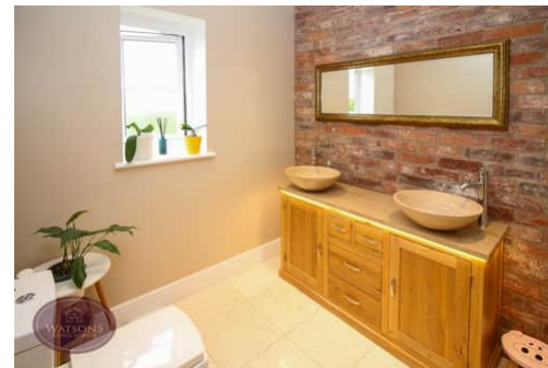
Our Seller says....