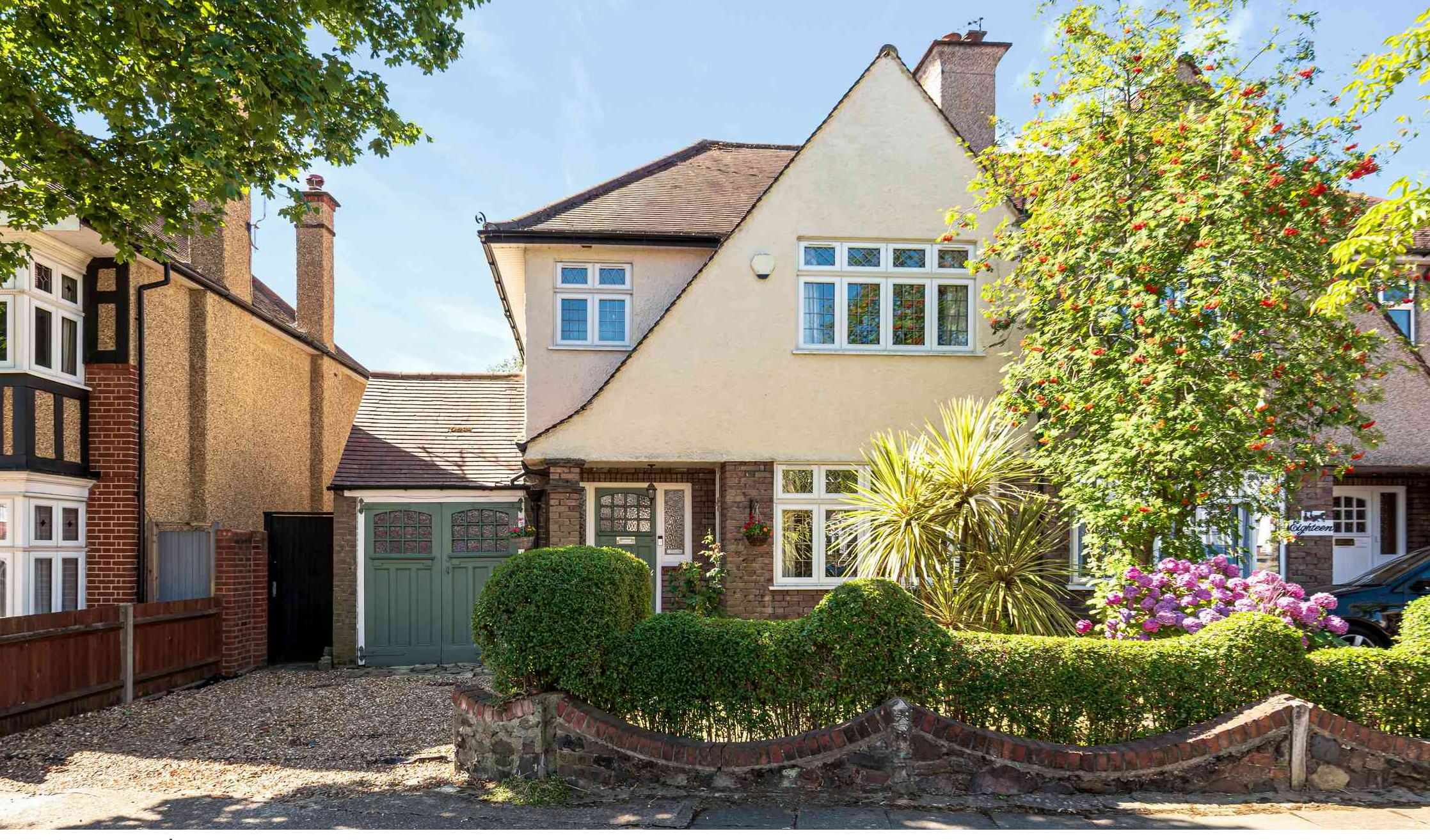
Briar Road, Harrow, HA3 0DR