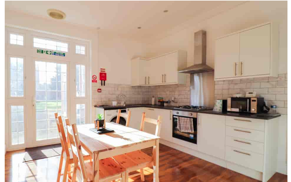
Abington Grove, Northampton NN1 4QX Guide Price £600,000 - Freehold