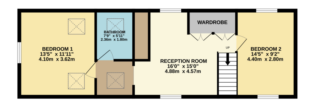
GROUND FLOOR 612 sq.ft. (56.9 sq.m.) approx.