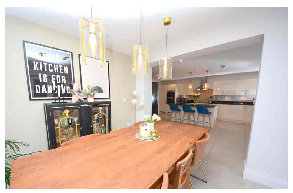
5 Buckingham Close, Kings Sutton, Northamptonshire. OX17 3FT Guide Price £735,000 - Freehold