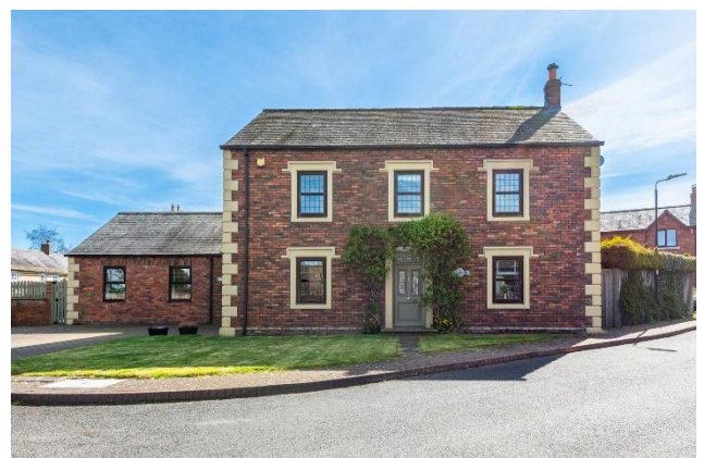
FRONT OF THE PROPERTY