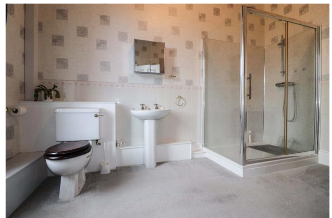
MASTER BEDROOM & SHOWER ROOM

BEDROOM 2 (16'7 x 12') Original cast iron fireplace, double glazed window to the rear, radiator and coving to the ceiling.