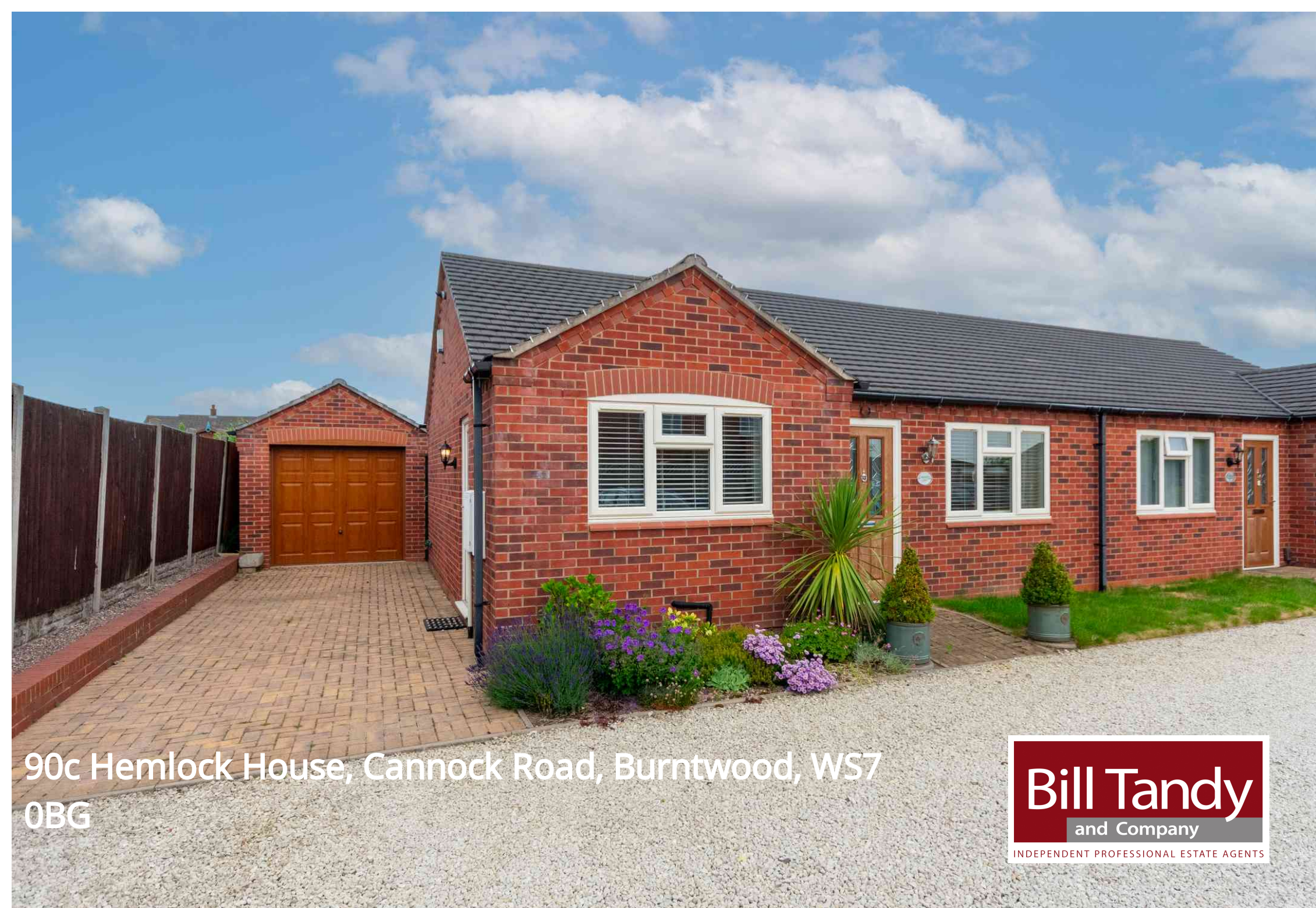
90c Hemlock House, Cannock Road, Burntwood, WS7 0BG