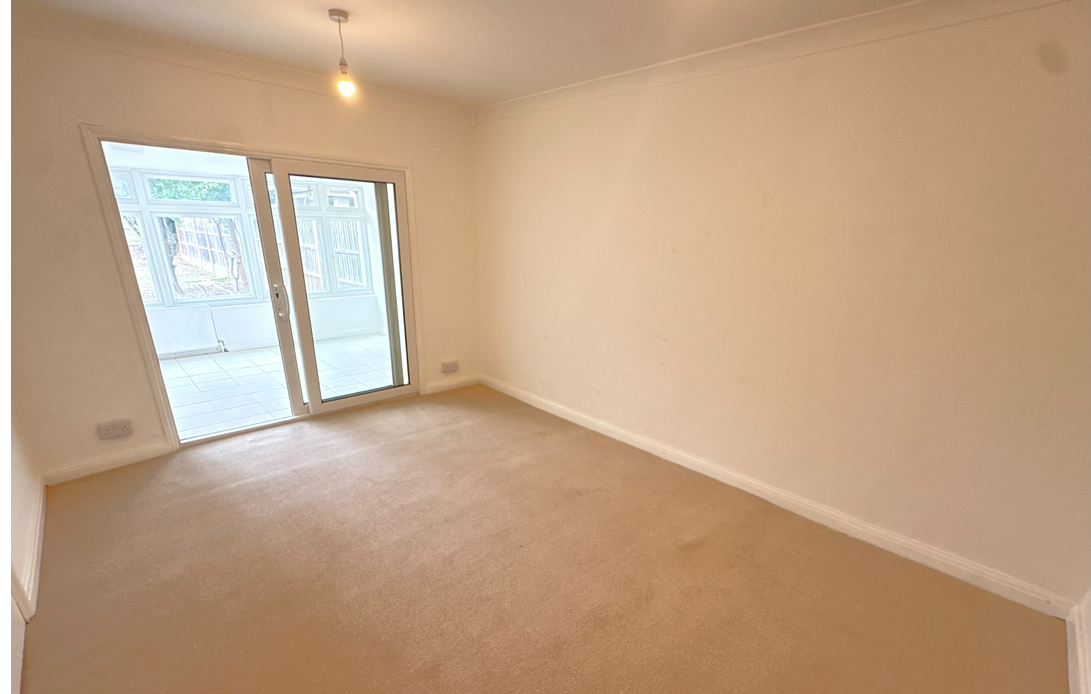
11a Doris Road, Ashford, Surrey TW15 1LS £475,000 - Freehold