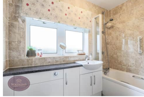
Our Seller says....