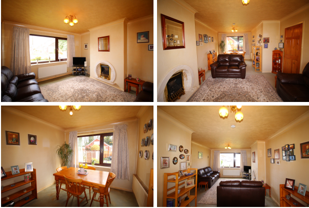
3.46m x 6.58m (11' 4" x 21' 7") Through lounge and diner with 2 x radiators, 2 x double glazed windows. Gas fire with surround and coved ceiling.