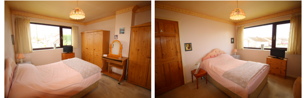
3.50m x 3.27m (11' 6" x 10' 9") Position at the front of the property with double glazed window and radiator