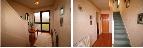
3.75m x 1.83m (12' 4" x 6' 0") Entrance hallway with laminate flooring and gas central heating radiator.