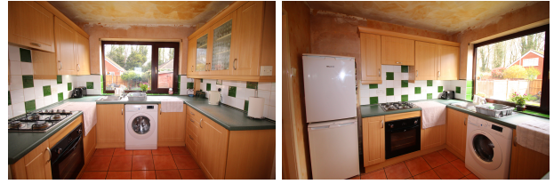
2.76m x 2.59m (9' 1" x 8' 6") A range of wall and base units. Plumbing for washing machine, oven, hob and extractor fan. Storage cupboard, double glazed window, tiled floor and door access into rear garden.