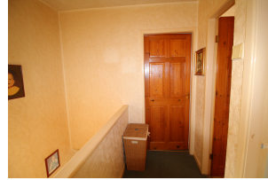
Double glazed window and loft hatch.