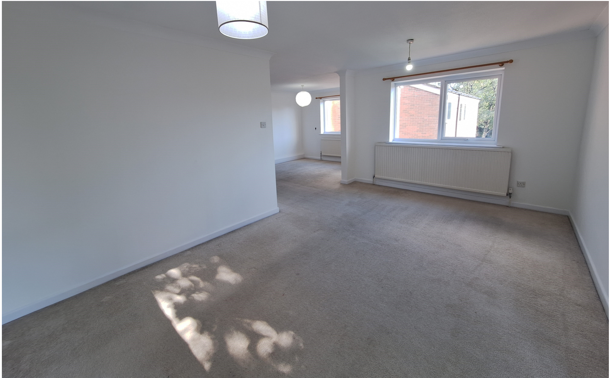
Grosvenor Road, Bournemouth BH4 8BQ