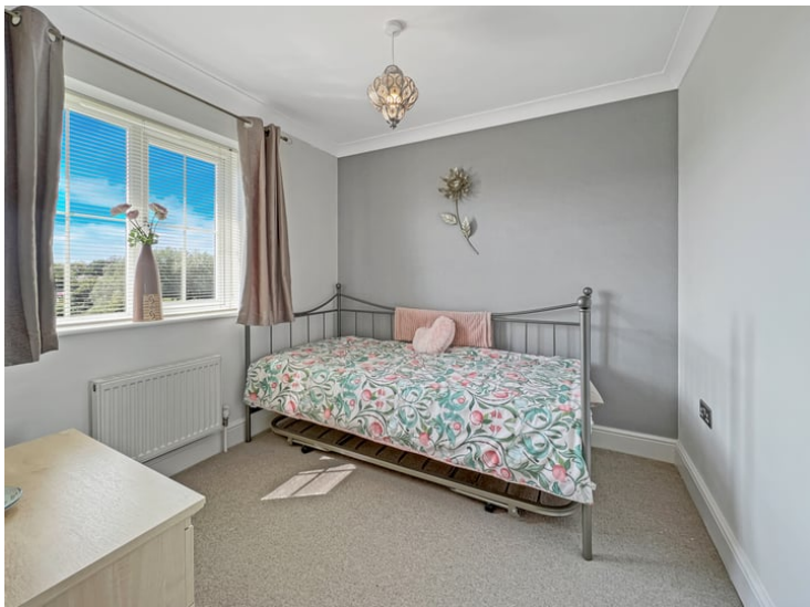
10' 5" MAX x 8' 2" (3.17m x 2.49m)