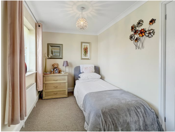
10' 1" x 7' 3" (3.07m x 2.21m)