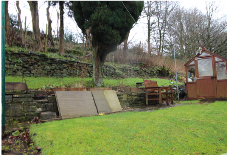
Starting Bid £175,000