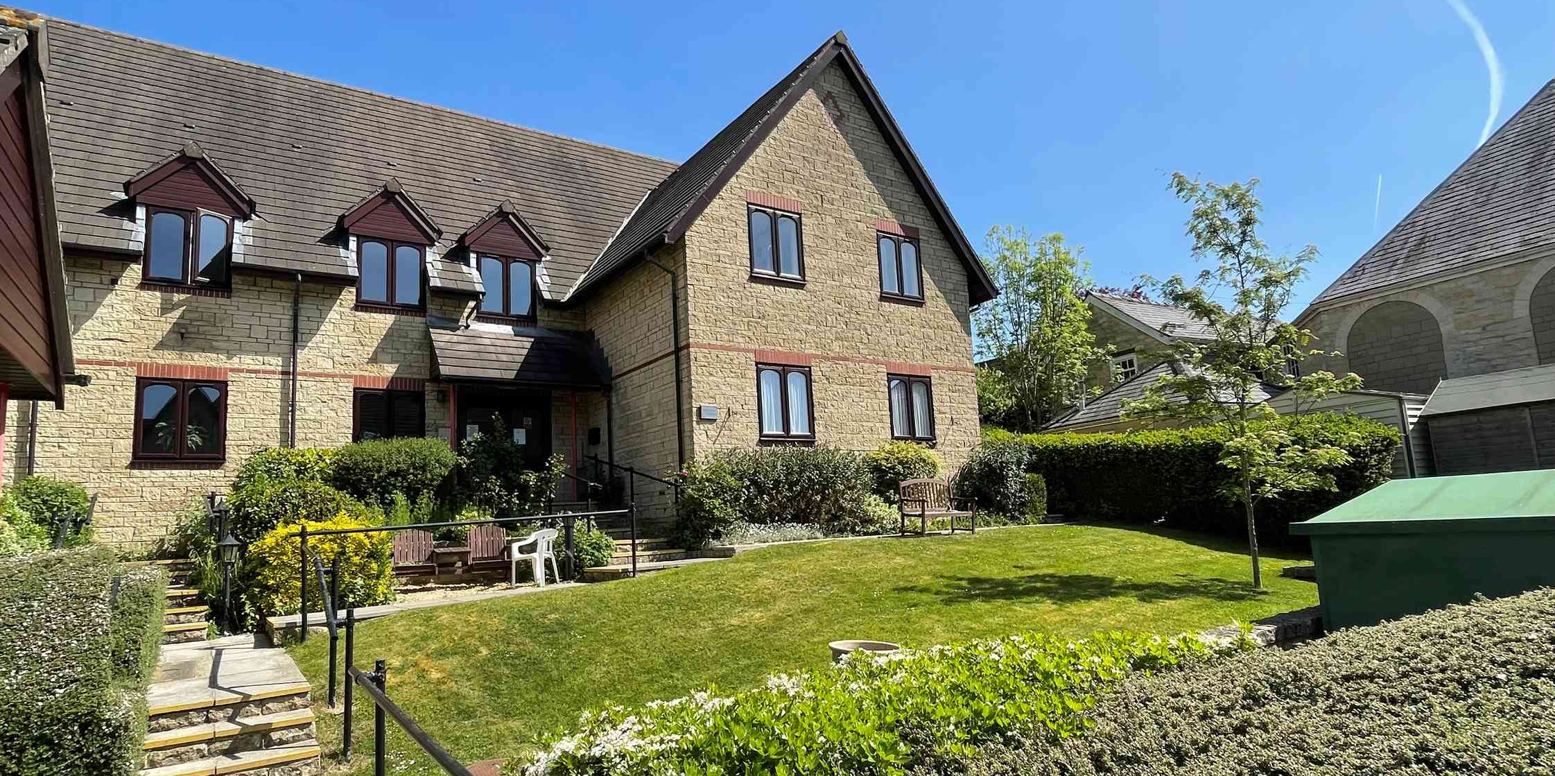
41 Spinners House, Wesley Court, Stroud, Gloucestershire, GL5 1DS Guide Price £95,000