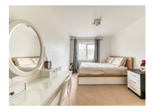
Halstead Close, Croydon, Surrey, CR0