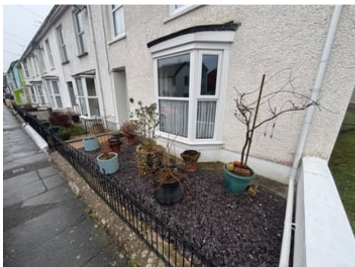
GARDEN (FIRST IMAGE)