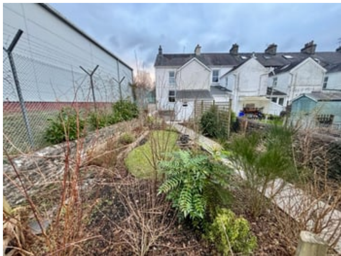
GARDEN (THIRD IMAGE)