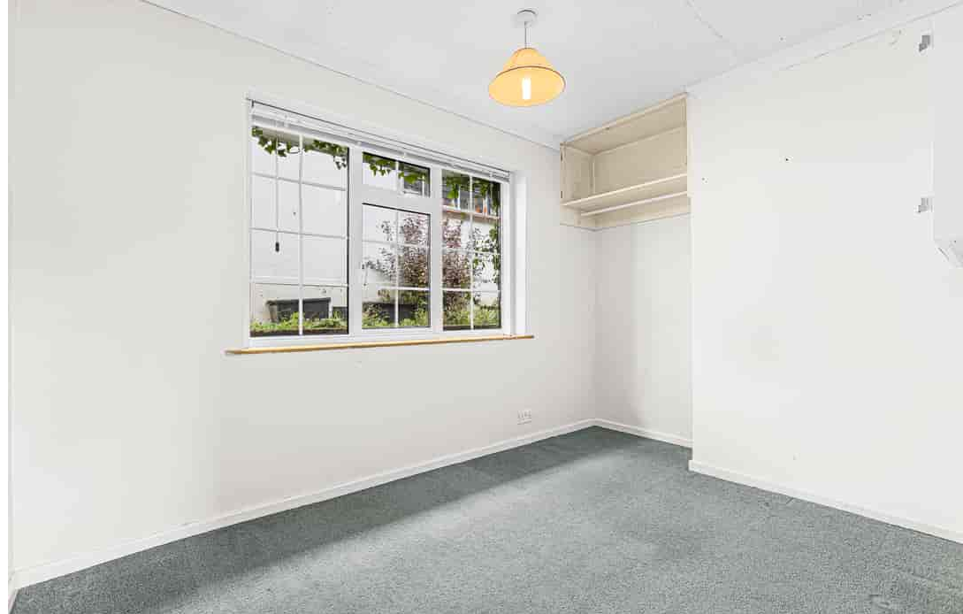
33 New Road, Marlow, Buckinghamshire SL7 3NQ £625,000 - Freehold