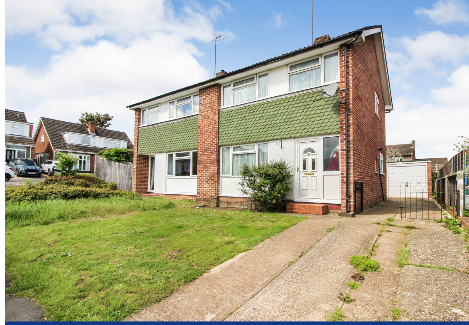
Gwynne Close, Tilehurst, Reading.