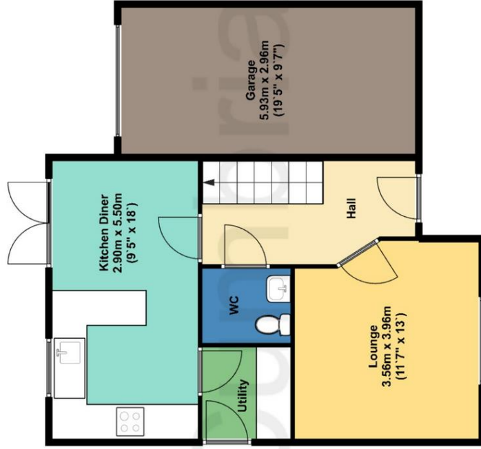
Ground Floor Approx 44.00 Sq meters (474.00 Sq feet).