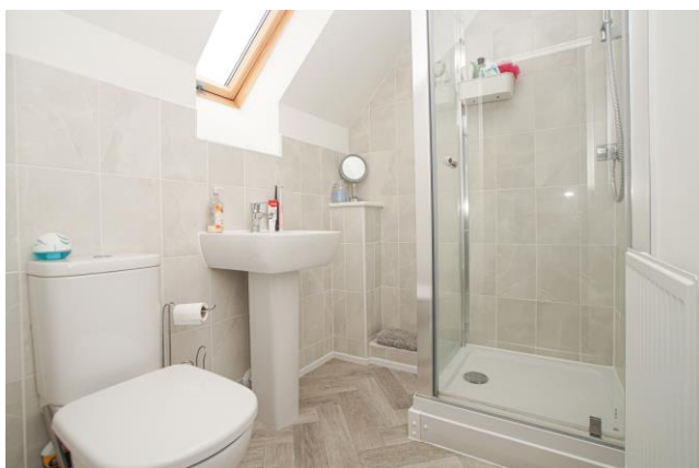
BEDROOM 1 EN-SUITE

EN-SUITE SHOWER ROOM (6'4 x 5') Three piece suite comprising WC, wash hand basin and walk-in shower. Velux window to the rear, wood effect vinyl flooring and radiator.