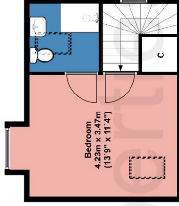
Second Floor Approx 23.00 Sq meters (248.00 Sq feet).