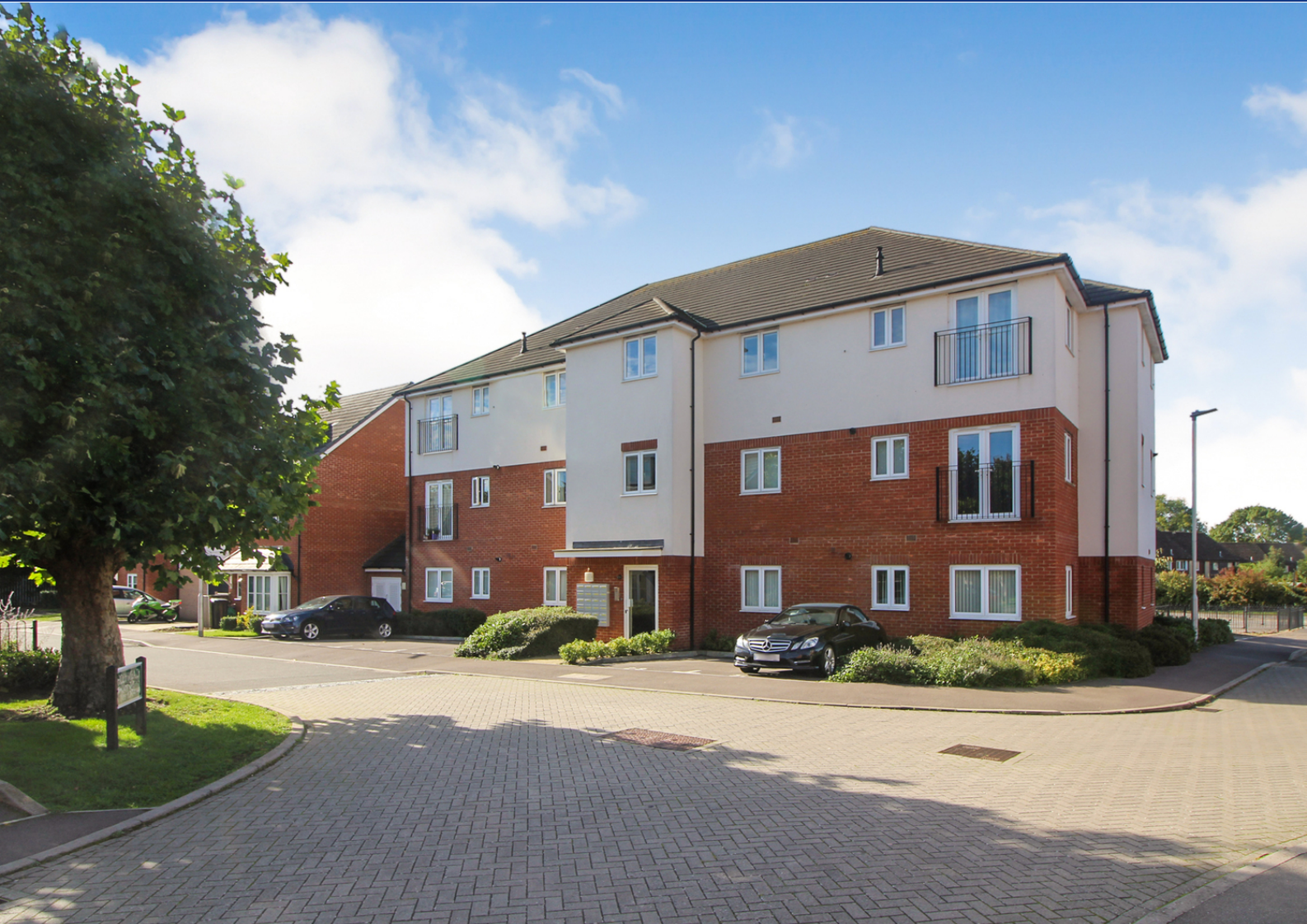
Holymead, Calcot, Reading, Berkshire.