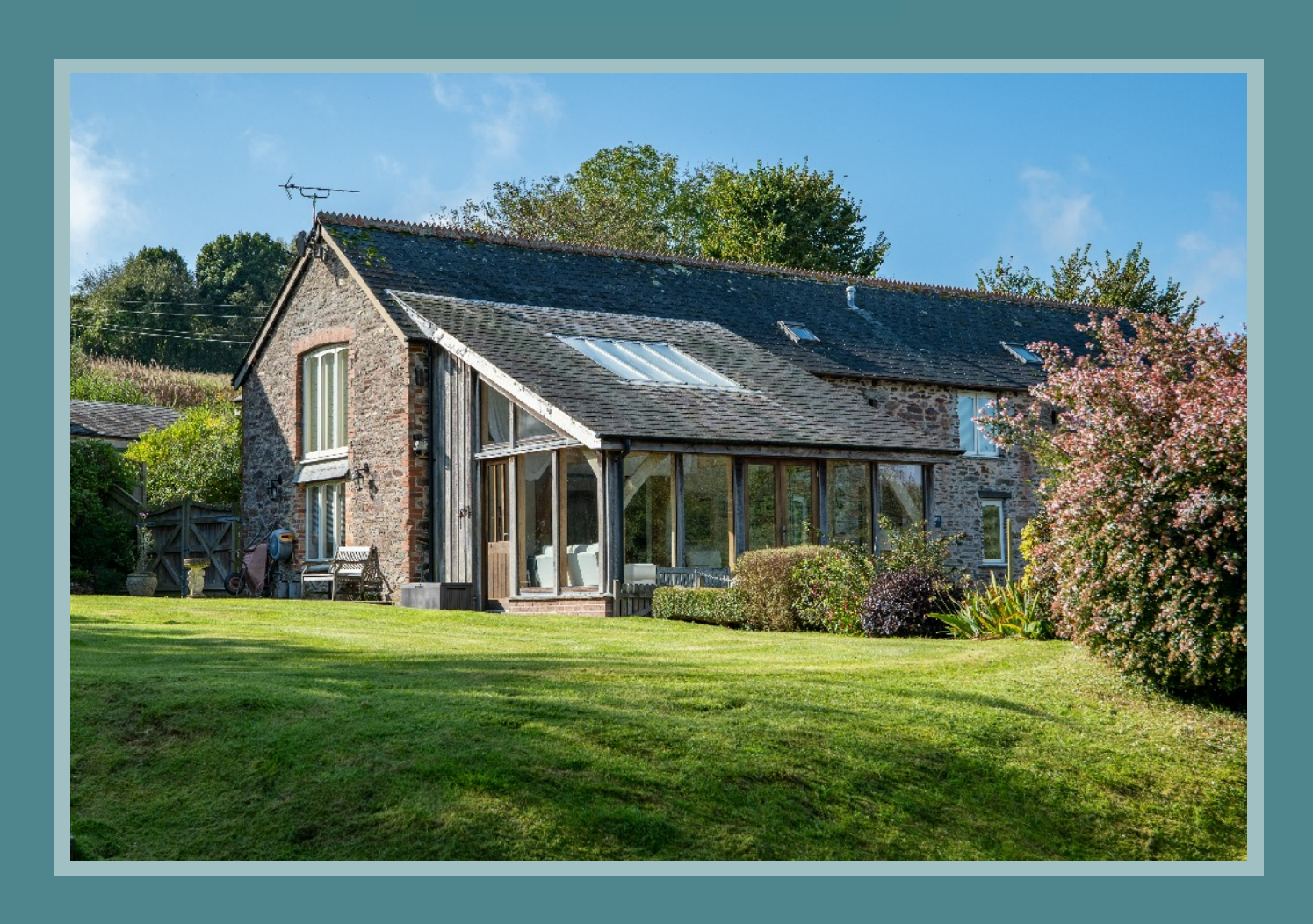
Foxglove Barn • Ford