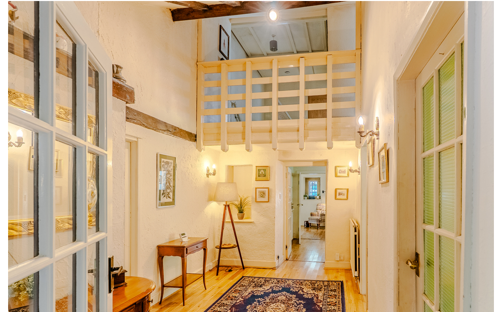
Chadwick Nick Lane, Fritchley, Belper, Derbyshire DE56 2HL £750,000 - Freehold