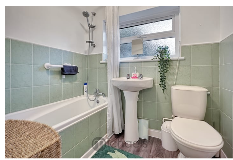
5' 3'' x 4' 7'' (1.6m x 1.4m) Low-level WC, pedestal hand wash basin, tiled bath with shower over, double glazed window to rear,