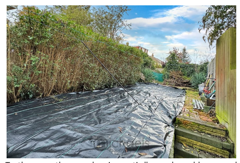
To the rear the garden is partially enclosed by panel fencing, laid to lawn with pathway to rear. The remainder of the garden is laid to lawn surrounded by an array of plants, shrubs and boarders.