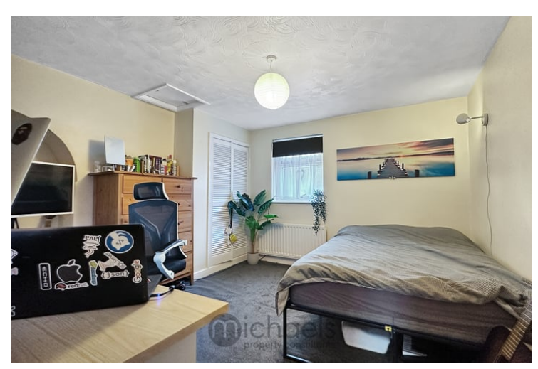
11'6" \times 11'2" (3.5m x 3.4m) Double glazed window to front, built-in storage, radiator, loft access