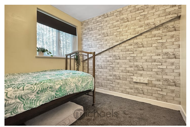
8^{\circ} 6" x 7' 10" (2.6m x 2.4m) Double glazed window to rear, radiator