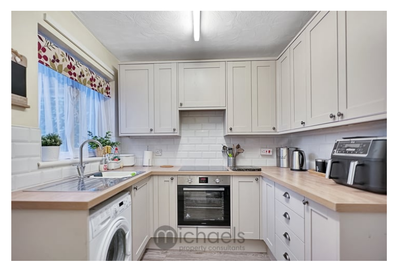
8'\ 10''\ x\ 7'\ 10''\ (2.7m\ x\ 2.4m) Range of fitted base and eye level units, space for appliances, double glazed window to front, wood effect laminate flooring.