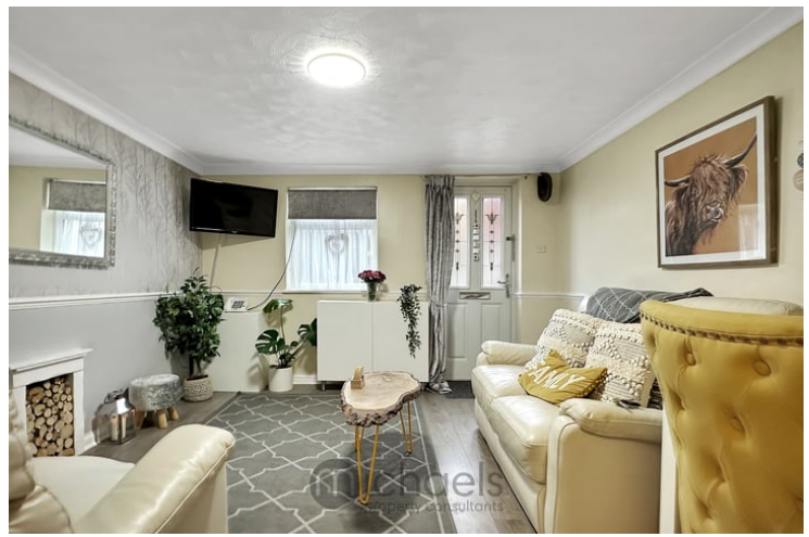
17' 9" \times 11' 6" (5.4m x 3.5m) Double glazed window to front, radiator,