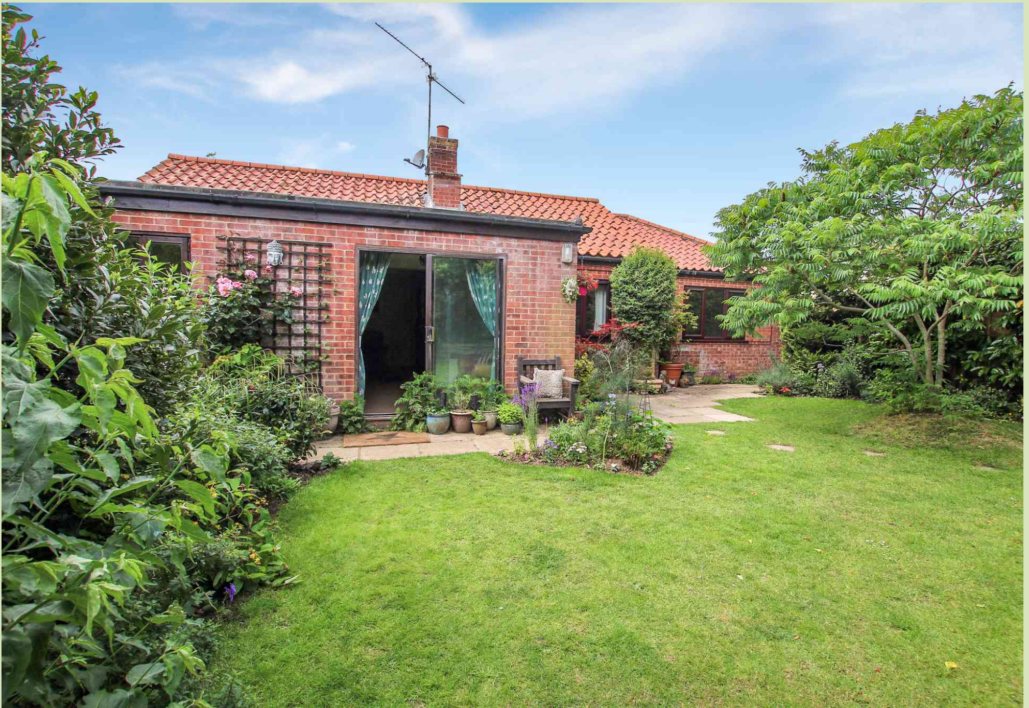
19 Walcups Lane, Great Massingham Guide Price £345,000