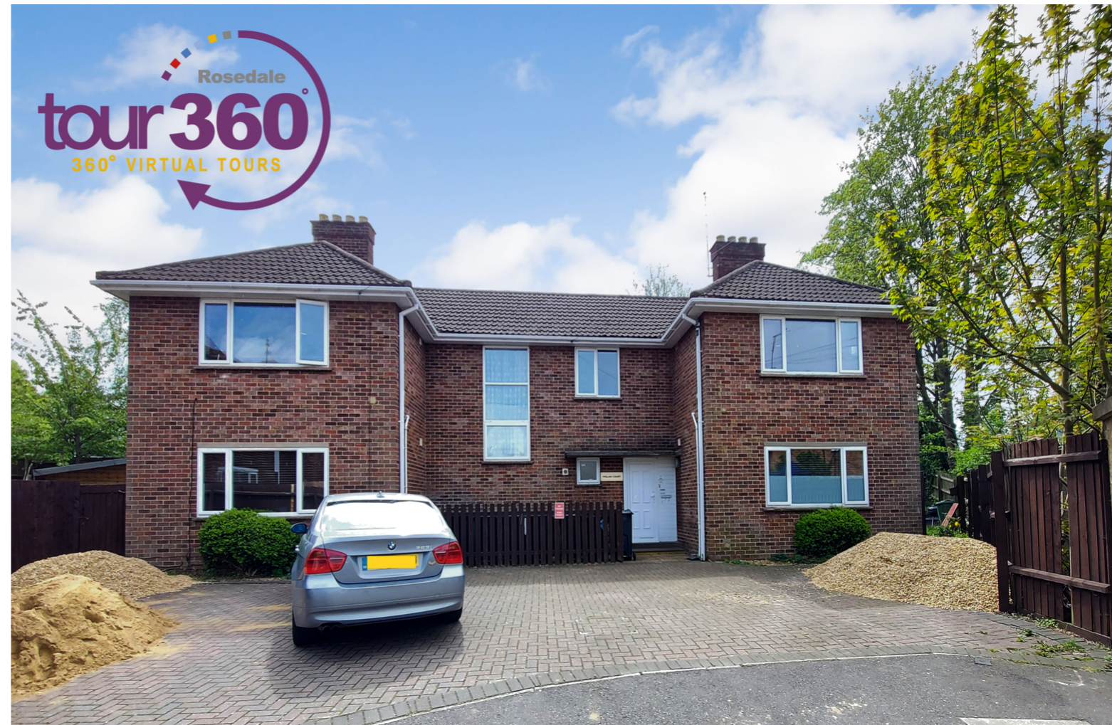
1 Willan Court Brewster Ave, Peterborough PE2 9PR